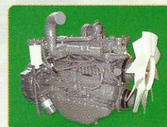
E/G INJECTION THROTTLE LEVER