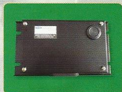
E/G SPEED CONTROLLER (ESC)