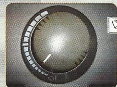
E/G SPEED CONTROL DIAL