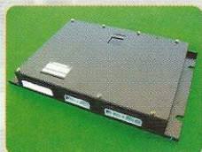
ECU or CONTROLLER